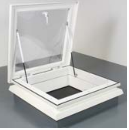
*Class B non-fragile to ACR[M]001 when new and fully installed in accordance with our instructions